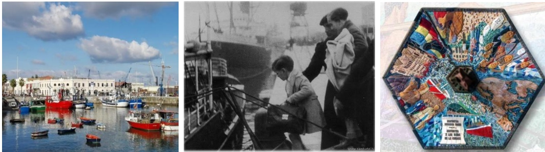
Place of departure of exiles ( brief description by Gernika )

12.45-13.15 Visit to the “monument” at the Port of Santurtzi. Place from which the basque children were taken abroad to the exile